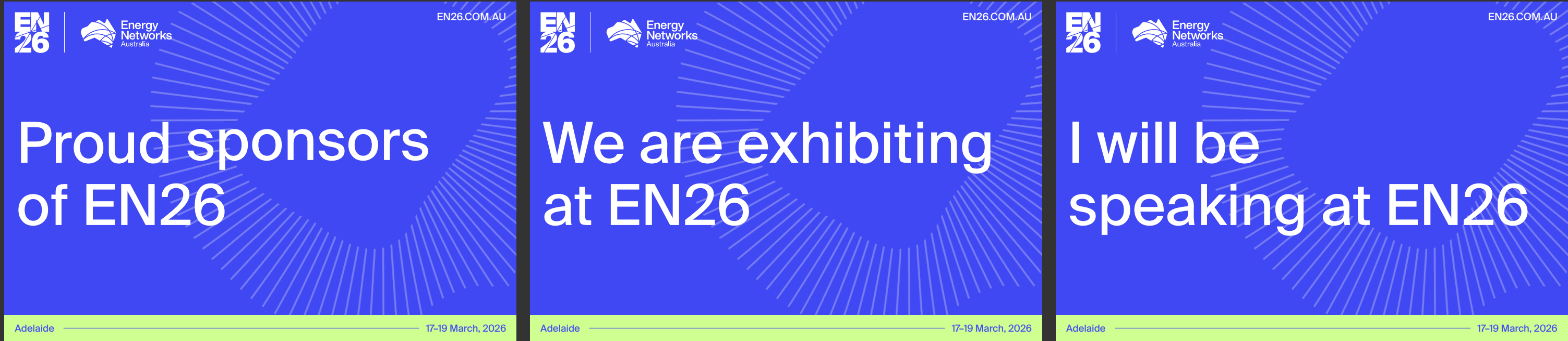
600x400 eDM/email Banners