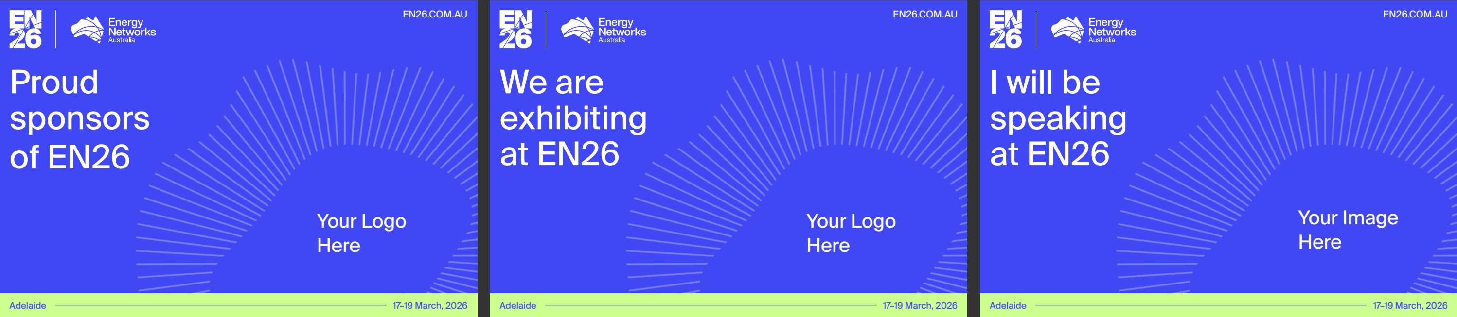
600x400 eDM/email Banners